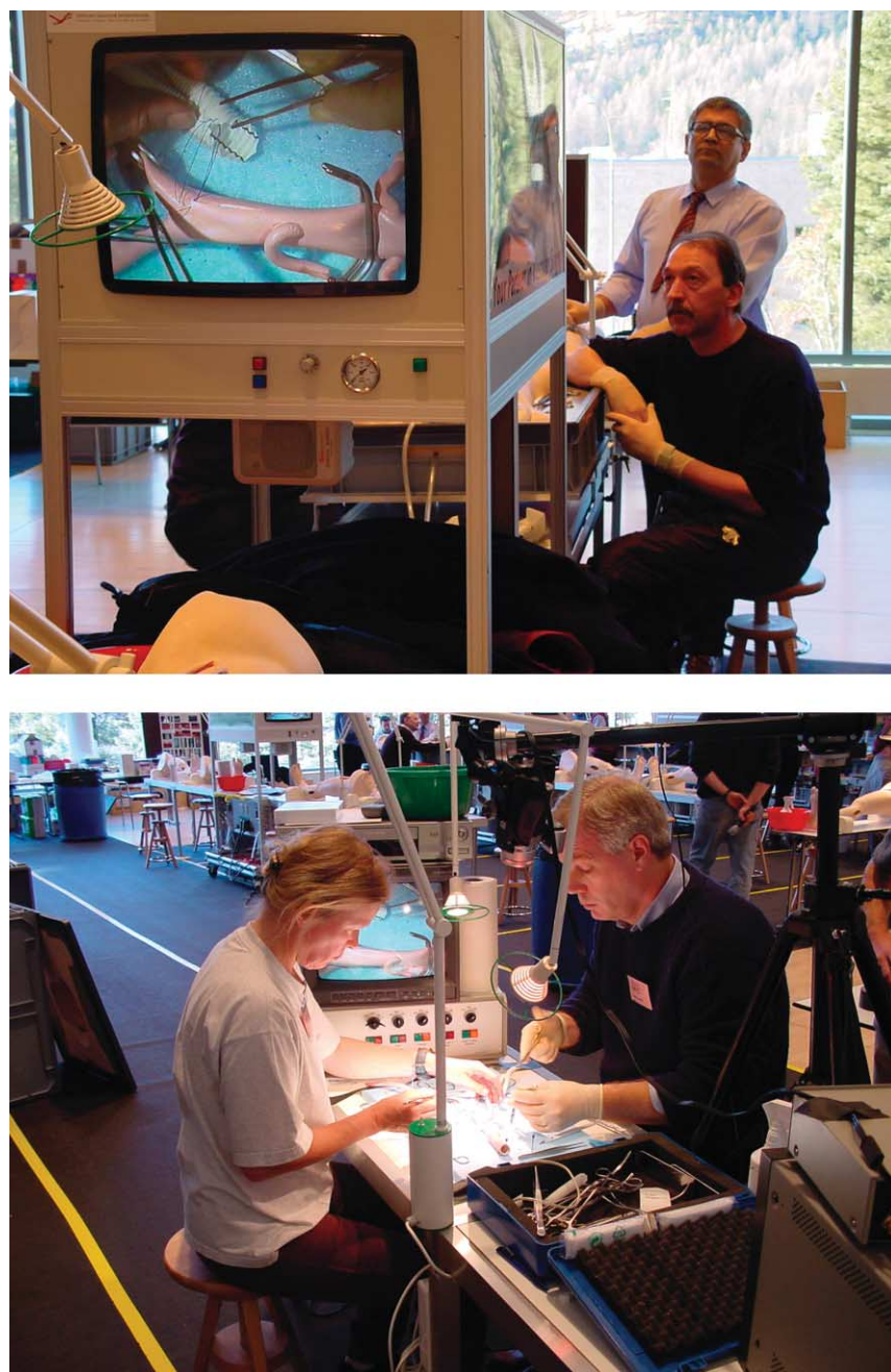
Fig. 1. The workshop, trainer performs procedure, a visualiser transmits the live video feed to each of the workstations. In addition feedback is provided by roving tutors.

(OSATS; Cronbach's \alpha=0.96 ), procedural skill (ICEPS \alpha=0.98 ) and assessment of the end product (EEVA-AAA \alpha=0.92 ) was high.